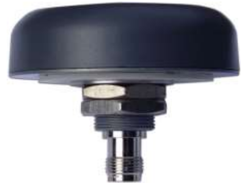
TW3870 Dimensions (mm)